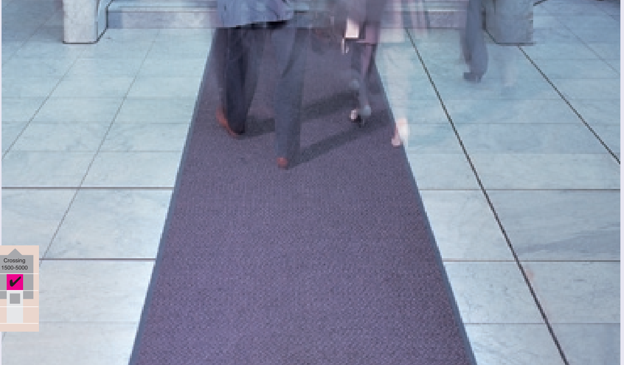
Airport Germany, 5000 crossings/day

Looking for a radical solution for dirt and water problems in entrances with very high traffic?